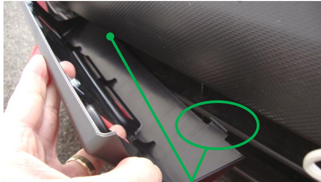
Hook (left and right side)