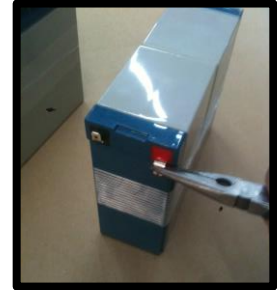
Bend F2 terminals 180 deg. (black IS bent)