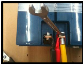
Step #1: Use supplied fasteners that come with batteries. Bolt RED main cable to RED battery terminal...Black to Black. Lockwashers on nut side, Torque down tight.