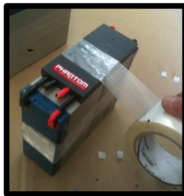
Place series block as shown, press connectors on F2 terminals. Make sure they are seated tight, tape as shown.