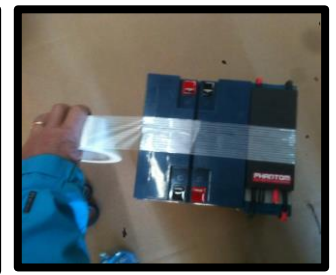
Bring tape around, pull tight.