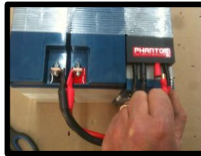
Step #2: Press and wiggle on bullet connector. Black to black. Red to red.