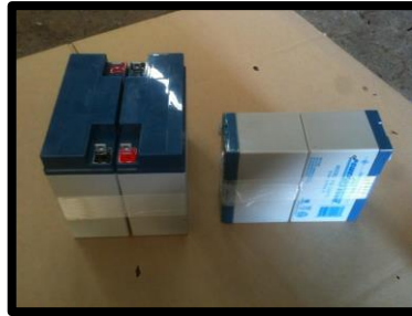
Using 2" wide filament tape...tape as shown