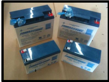
Batteries: Two 18AHr, two 9AHr

1.5 dump battery assembly. Follow steps to prevent accidental short.