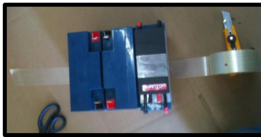
Lay a strip of 2" wide filament tape sticky side up...place batteries as shown, tightly together.